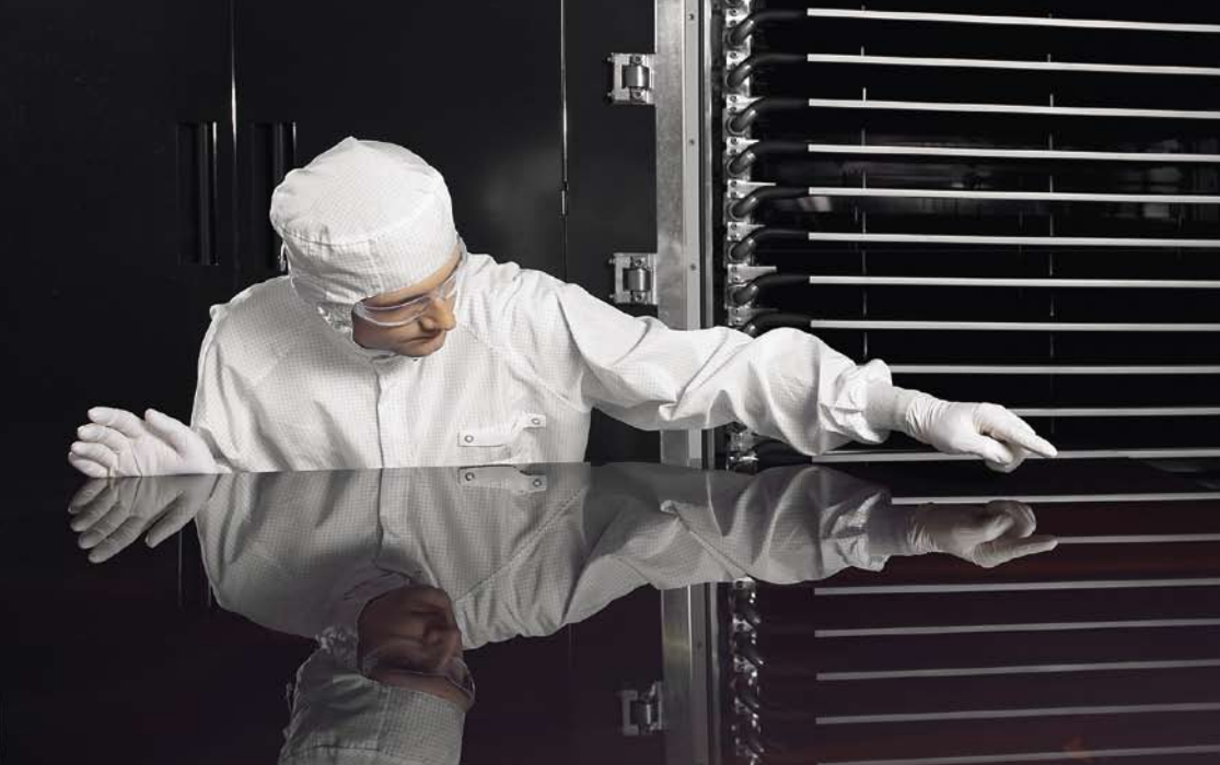
In the process: A micro-technology specialist tests a solar module in the clean room at Inventux