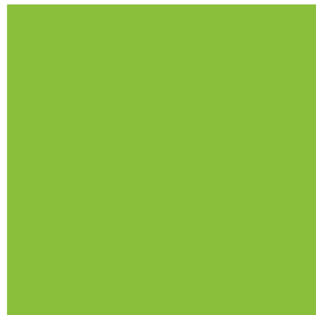
"Ahrensfelder Terrassen" – thanks to its Mediterranean flair, one of the area's most popular residential addresses