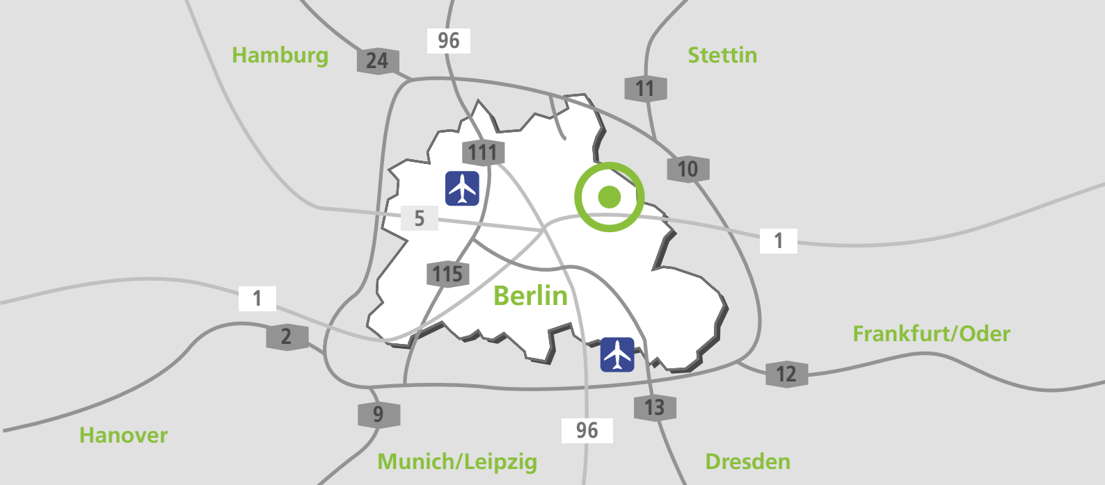
The location of the Clean Tech Business Park in Berlin

Investment Support & Advice. With the help of our partners in the fields of property and facility management, financing and funding, we will provide you with ongoing strategic business investment advice leading up to your investment in the Clean Tech Business Park Berlin-Marzahn – and afterwards as well.