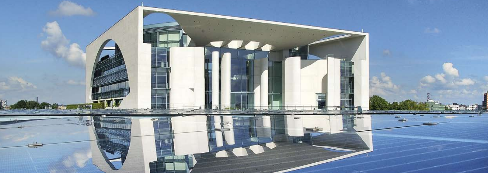
The Chancellery in Berlin