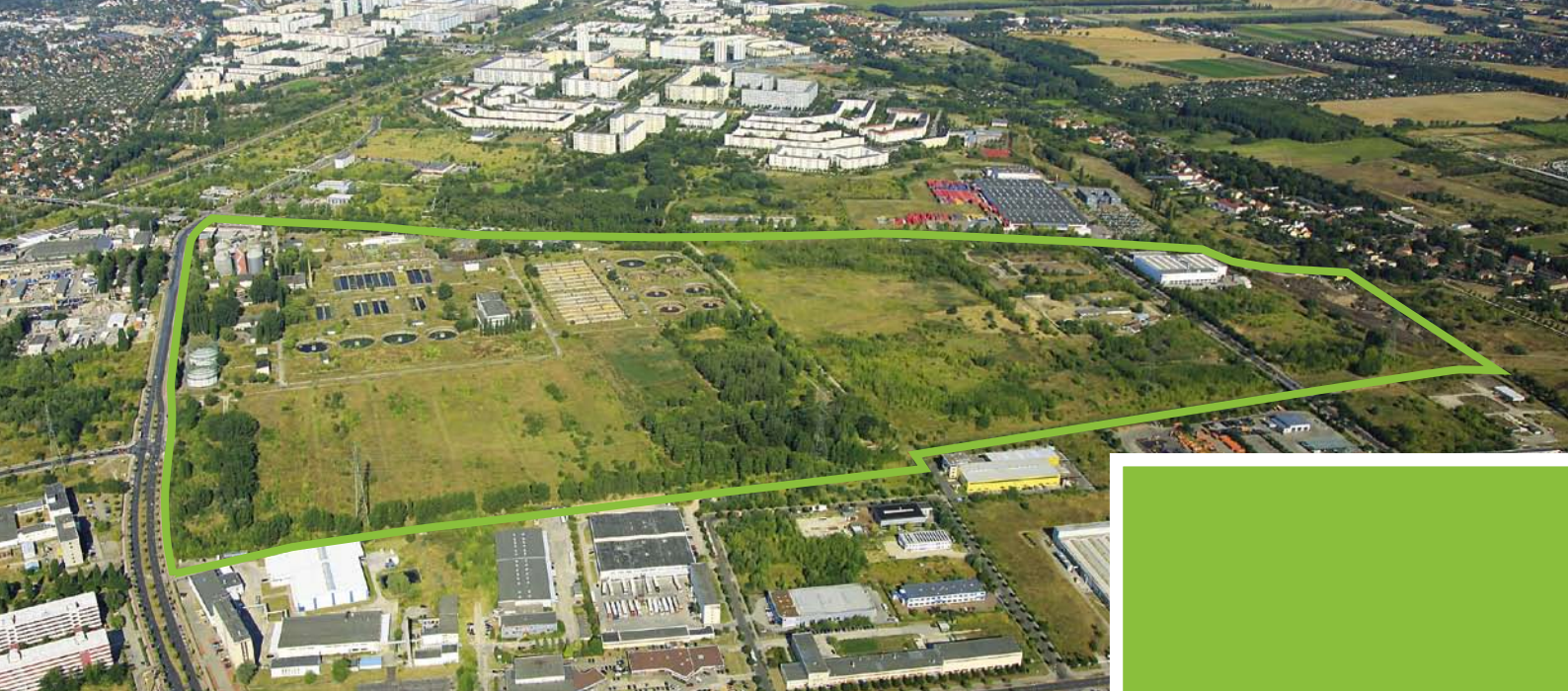
Area plan for the upcoming Clean Tech Business Park Berlin-Marzahn