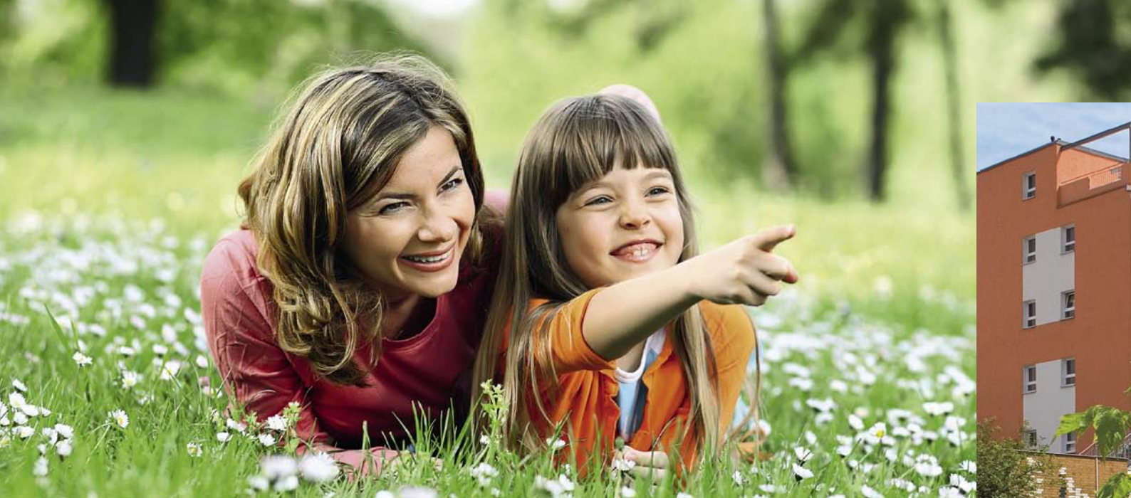
Families are a top priority in Marzahn-Hellersdorf