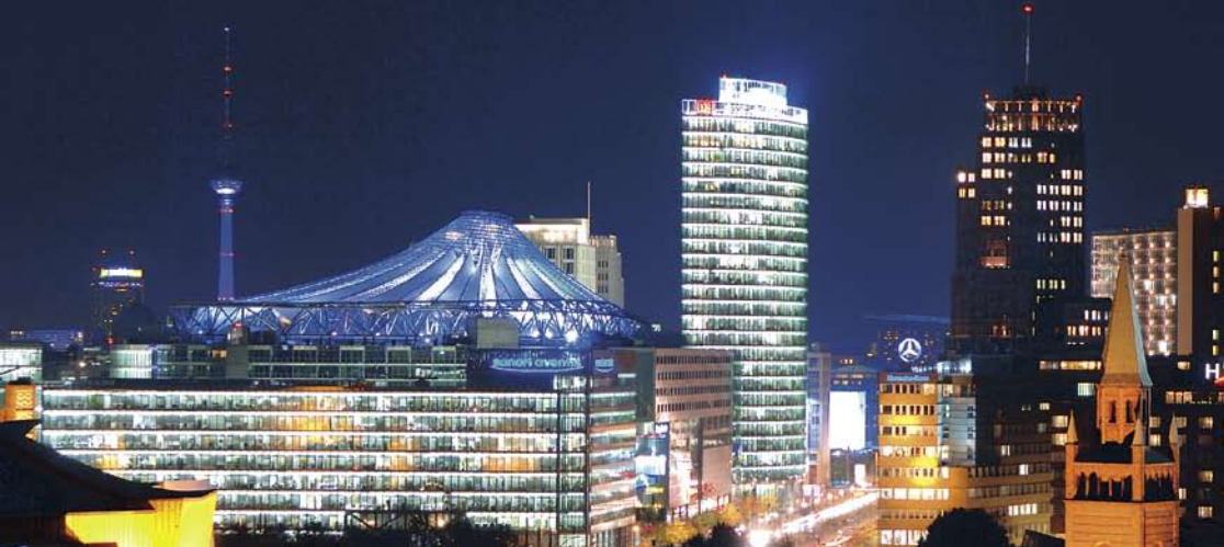
Potsdamer Platz